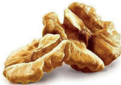
Figure 2 Sticks