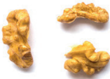
Figure 1 Butterflies

The Company has its own walnut orchards, where it grows traditional and its own varieties of walnuts. The total area of the orchards is 40.5 hectares. Walnuts are exported mainly to the Russian Federation. The main customers are Russian confectionery shops and processors.