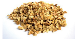
Figure 3 Slivers